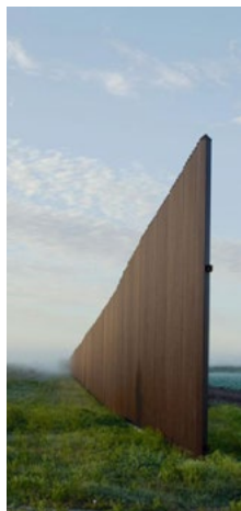
Both Sides 2018