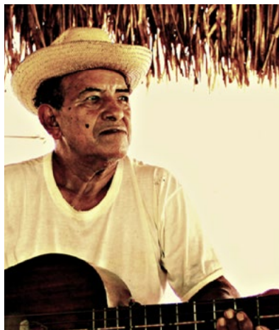
La Bamba: The AfroMexican Story 2020