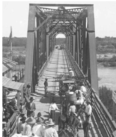
Mexican Border War 2018